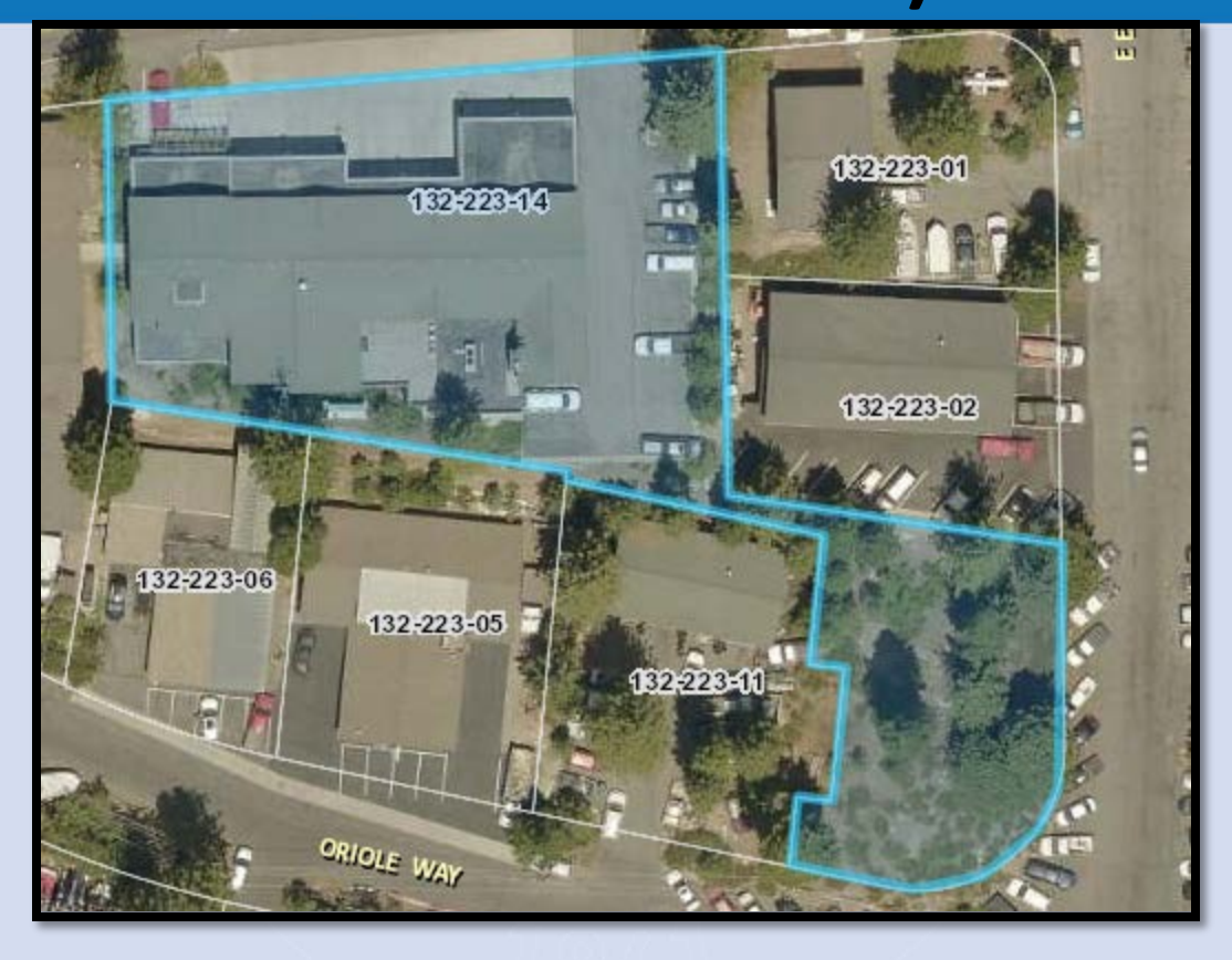
Washoe County Board of Adjustment July 1, 2021